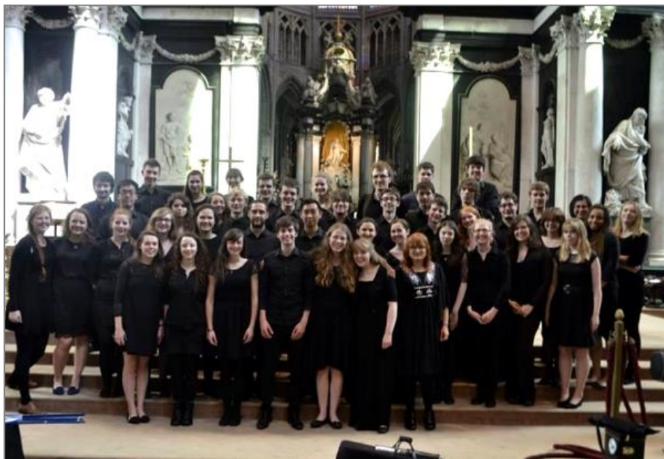
ABOVE: DUPO group photo in Sint-Baafs Cathedral, Ghent