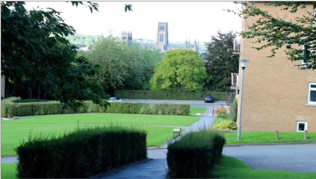
ABOVE: A peaceful afternoon at Grey College during Summer 2013