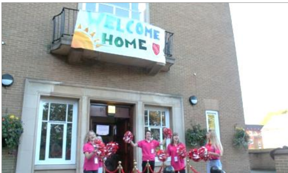
ABOVE Freshers Representatives, use their cheerleading skills to welcome the next generation of Grey Students

In the coming year there are potential risks to the JCR as we know it, most troubling is the