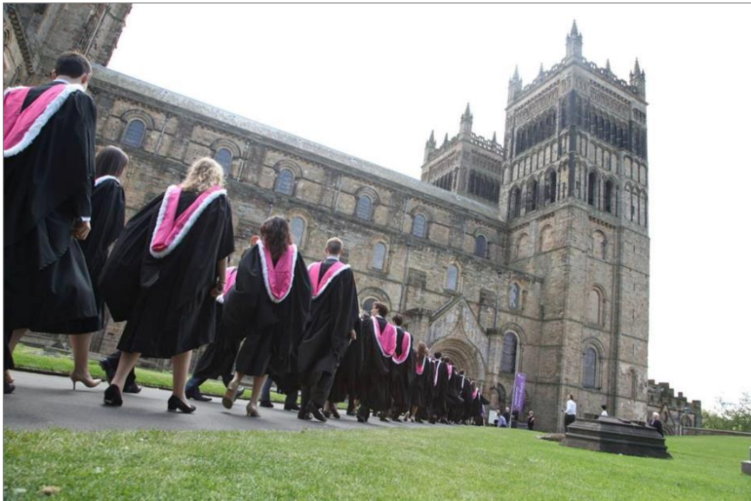
ABOVE: Students processing to the Cathedral during Graduation 2014