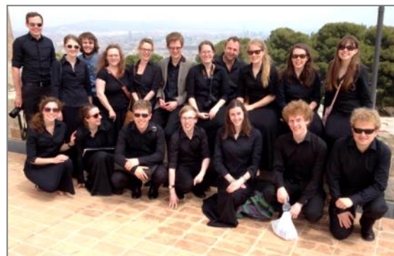
ABOVE: The choir on the rooftop of Montjuïc Castle

hundred's of holiday videos! That night we treated ourselves to traditional Spanish cuisine of paella and sangria. The next day we had a chance to explore the Parc de la Ciutadella, taking full advantage of the sunny weather and letting our competitive side get the better of us in a row boat race on the lake. To end our trip we performed in the Palau de la Musica concert hall along with two brass bands, which certainly made for a varied concert programme and was an excellent way to round up what had been a wonderful musical week.