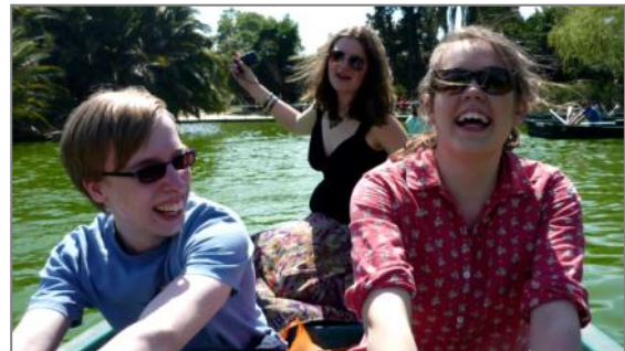
ABOVE: Fun on the lake at Parc de la Ciutadella

Both tours were incredibly fun and rewarding in that I was able to perform music to such a high standard in great locations, become better acquainted with the choir and DUPO members and enjoy new cultural experiences.