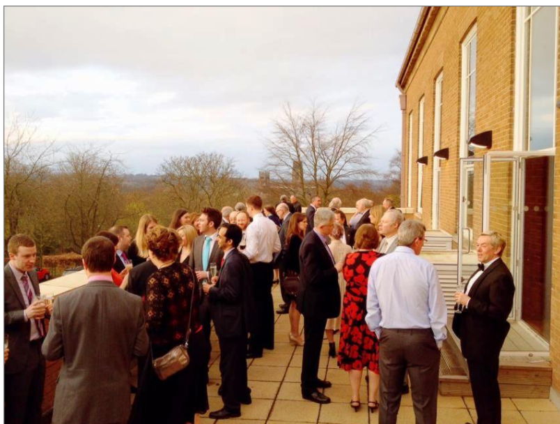
ABOVE: Pre-dinner drinks on the dining room balcony at the 2014 Grey College Association – Durham Reunion