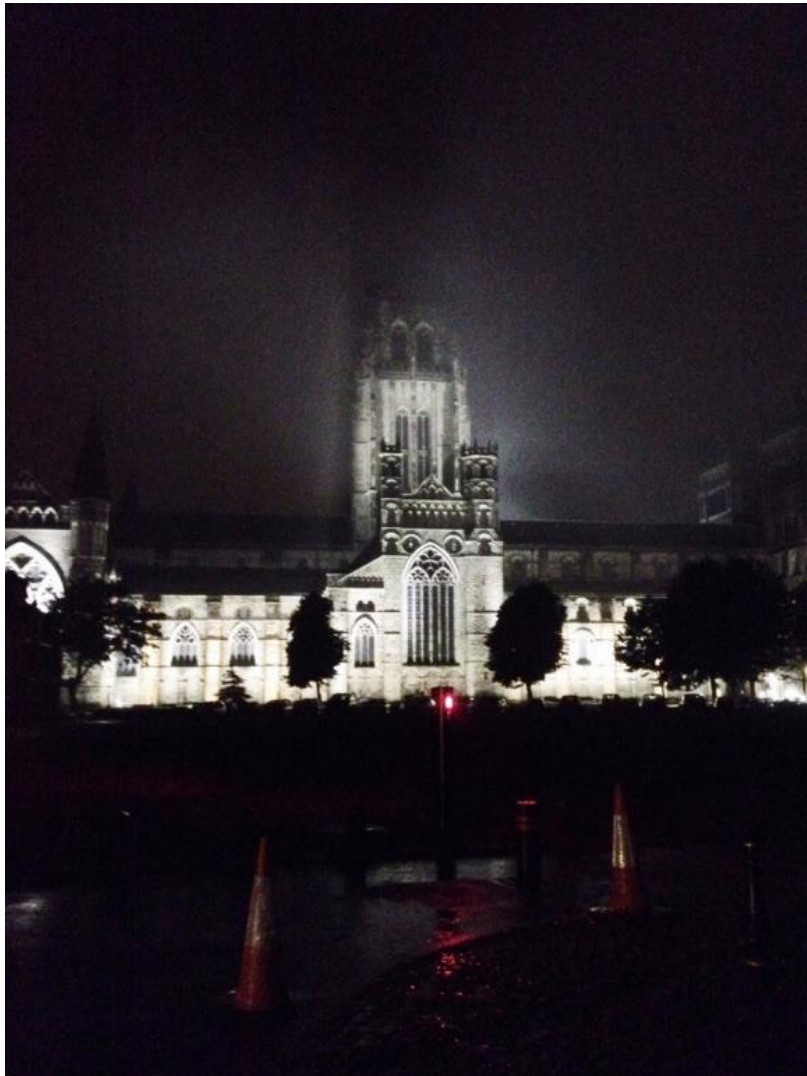
ABOVE: A stormy night at Palace Green results in this eerie image of Durham Cathedral captured in October 2014.