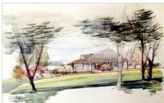
ABOVE AND RIGHT: Original Artists Impressions of Fountains Hall c.1960

In 2012 Grey College Association made an initial donation of £10,000 to the Grey Trust to kick start fundraising and we will continue to work with the College to deliver this project over the coming years.