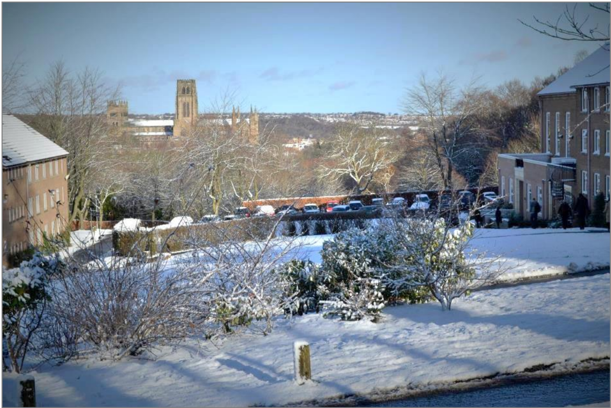
ABOVE AND BELOW: Naomi Tansey took these shots of Grey College during January 2015. Spectacular at any time of the year, the view of Durham Cathedral through the College from Holligside lane is always one to enjoy. Naomi kindly lets Grey College Association reproduce these images here.